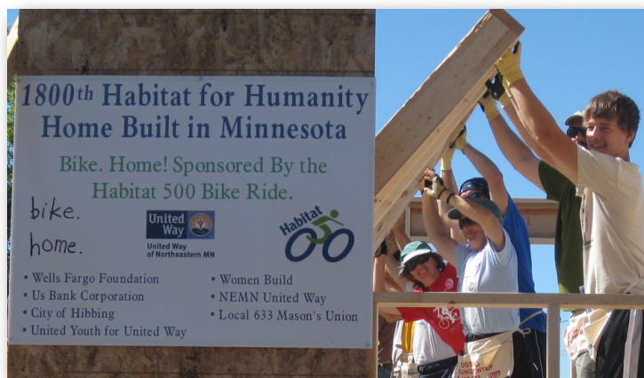
July 2010, Habitat 500 participants raised the walls on the bike.home. in Hibbing.